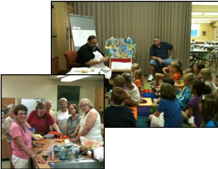
Photos of Vacation Bible School continue on page 13

VBS was another success this year, thanks to the many members, parents, friends and children who attended. A successful program is only as good as the people implementing it, so hats off to all of you! Our Ladies Aide, manned the kitchen each night, turning out delicious suppers! (A few men were in there also!) Most of the volunteers came from our church, so thanks to all of you. If I counted correctly, we had around 35 volunteers during the week and 26 children attending from St. Paul's. In all we had 91 children registered with an average of 75 each night. Generous free will offerings made it possible to stay within our budget by. Each of the three churches contributes $350 for VBS. Offerings at supper each night helps buy materials and food. Thanks to all the ladies who sewed the aprons.